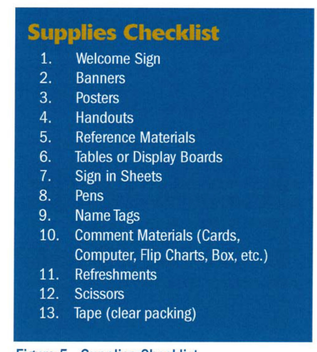
Figure 5. Supplies Checklist