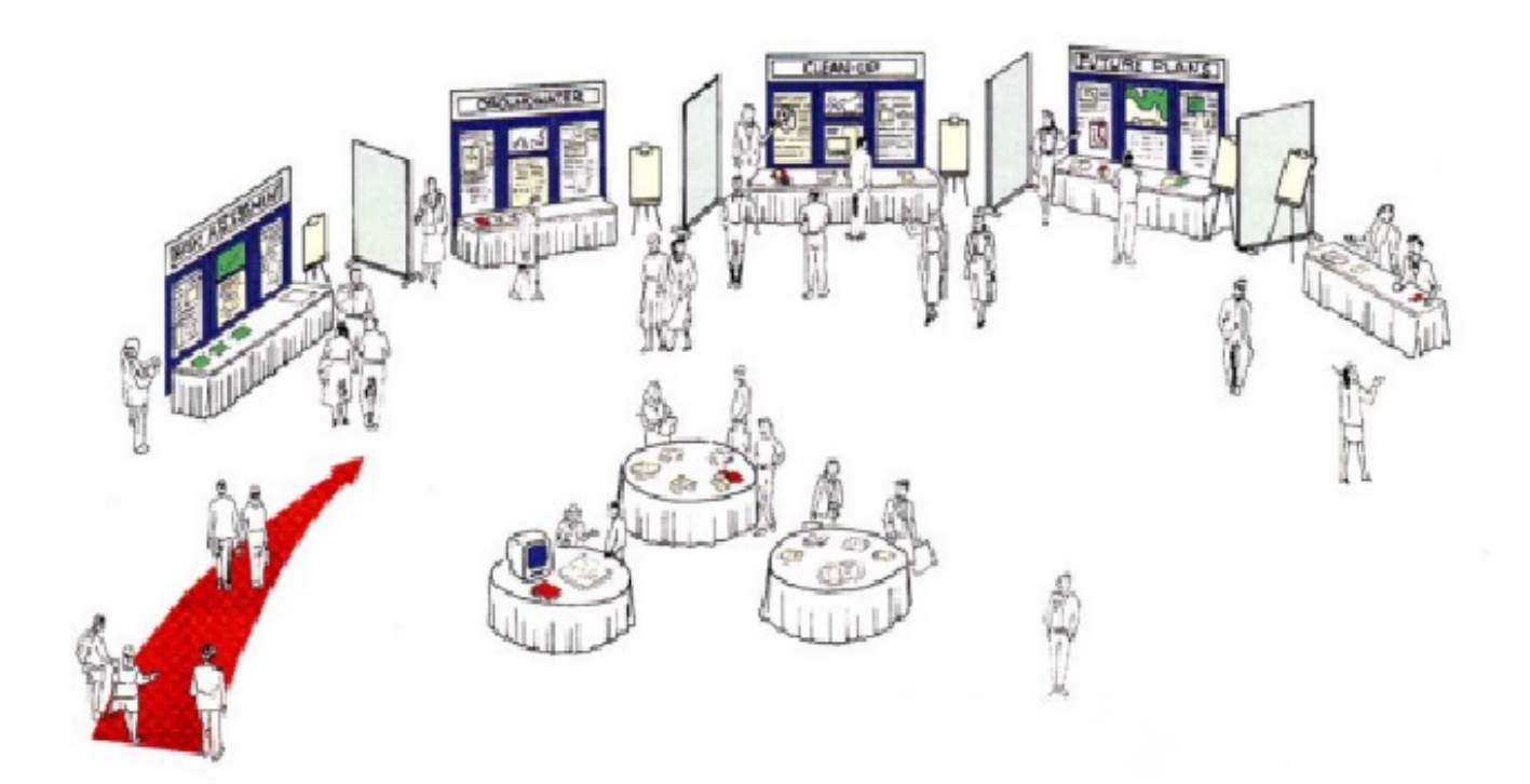
Figure 1. Typical Information Session Layout

Primer before developing materials to present at your information session or selecting your 'subject matter experts' to man your displays. There is much to be considered and understood about message development, messenger selection and preparation before effectively providing information to the public or other concerned audiences. Please contact NMCFHPC for more assistance or more information.